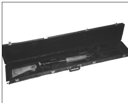
Left: Browning's $200 Traditional 11152 Full-Length Shotgun Case has a wooden shell and frame and is covered with vinyl. The interior is covered with a soft, foam-backed fabric. It was 53.4 inches long, 8 inches wide, and 3 inches deep.

Still, every silver lining comes with a cloud, and the Browning's flaw is its relative lack of security, in our estimation. Only a half-dozen or so hammer blows were required to break open the lockable latches, placing it at the bottom