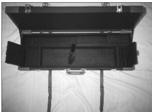
Left: The Elk River Shotgun Case, $220, has a padded cloth exterior, with leather trim, leather straps, and two lockable latches. Despite its stylish appearance, it performed admirably in durability testing.

I We can't deny that the Elk River Shotgun Case is a good-looking gun case, but for $200, we would like to see it stand up to abuse better. This case would fit best in your new BMW Z3 roadster as you zip back and forth to the local trap or skeet range, but we wouldn't use it for serious traveling.