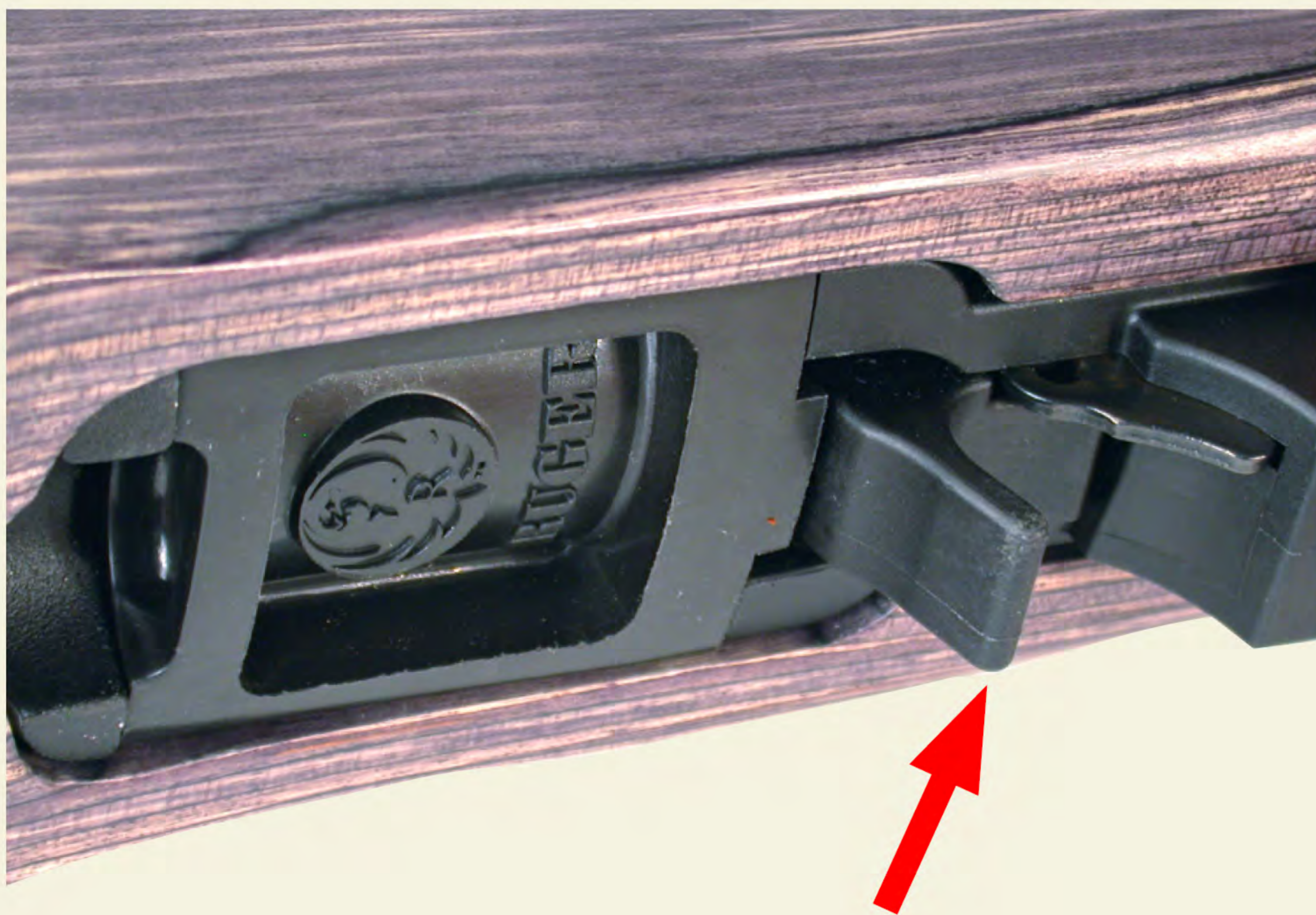
Above: The magazine release was enhanced by an extension lever. This saved a fingernail or two compared to the original design, but sometimes required some prodding at the front on the magazine before it would fall.

BARREL ..... STEEL ACTION TYPE ..... BLOWBACK STOCK MATERIAL/FINISH ..... LAMINATE TRIGGER PULL WEIGHT ..... 4.5 LBS. TRIGGER SPAN ..... 3.1 in. WARRANTY ..... LIFETIME TELEPHONE ..... (603) 865-2442 WEBSITE ..... WWW.RUGER-FIREARMS.COM