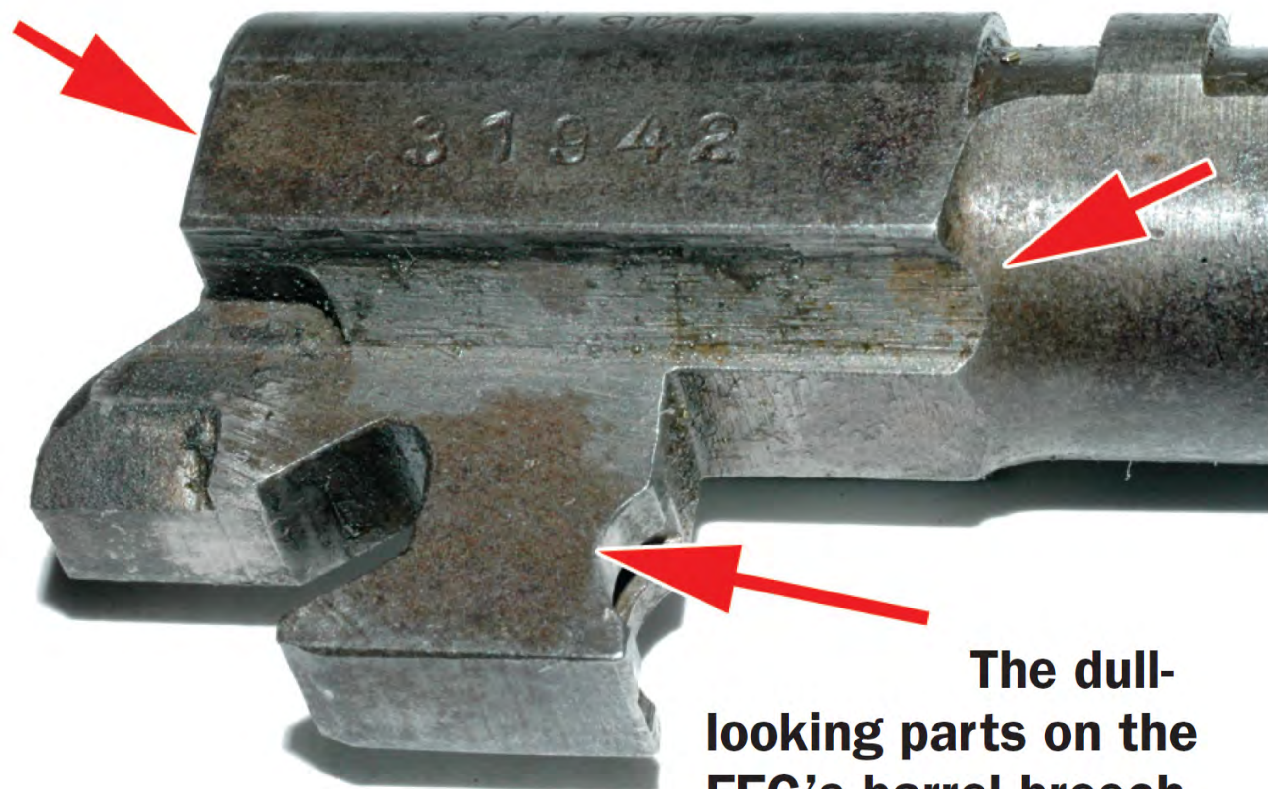
The dull-looking parts on the FEG's barrel breech were indeed rust.

Yet its inside was like new. This gun needed some care and good maintenance.