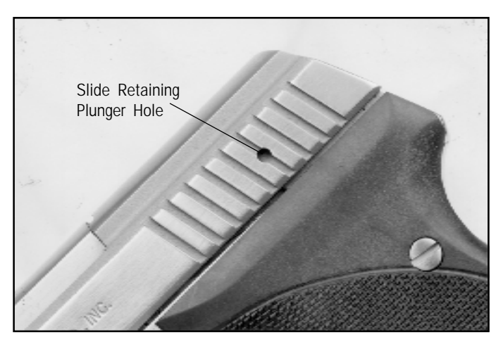
Left: Depressing the NAA Guardian's slide release button allows the slide to be removed. Right: The Seecamp LWS-32's slide is released by inserting a pin punch into a hole in the left side of the slide and depressing the slide retaining plunger.