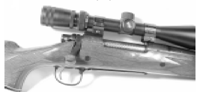
This rifle features nicely done skip-line checkering, Remington's clean lines, and that big trigger guard, which all add up to an affordable and goodlooking, powerful rifle.

Our recommendation: This is a low-cost, goodlooking alternative to high-performance .30caliber rifles, but be prepared for some recoil.