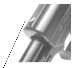
We had to add a dab of WhiteOut to make the Hi-Point's front sight visible.

The area between the metal slide and polymer frame was lubricated with a gob of white grease.