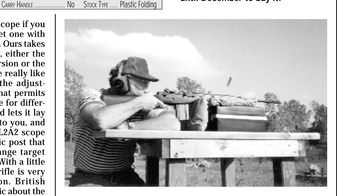
Most riflemen will prefer the comfort of the wood-stocked M14/ M1A in winter or summer. These rifles have the longest sight radius of all three types tested, and don't really need a scope. Note the vented forend guard on this rifle. That's an original Glissue fiberglass guard, not often seen today.

Our Recommendation: This is the battle rifle you want. Don't wait until December to buy it.